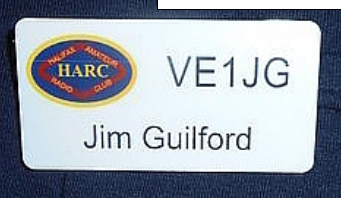
Sample Name Tag

NOTE: - The colour in the photo is lighter than actual, it is Navy Blue, as around the badge.