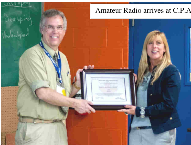
Amateur Radio arrives at C.P.Allen High School