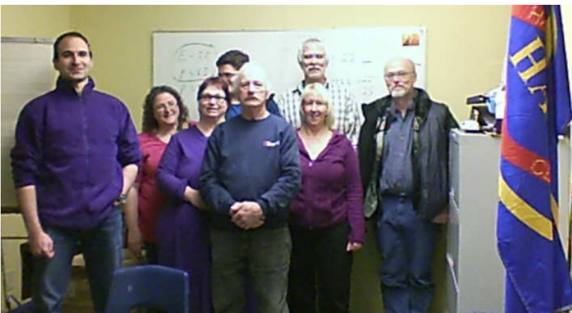
Some of the members of the Baofeng Radio class Saturday, January 17 at the HARC station

The Take-15 net is a good place to hear what is going on in the Amateur community and hear news of upcoming club events. You can also ask questions on topics of interest to Amateurs, perhaps technical, operating, building etc. So if you don't want to be a net controller right now at least check in to the net. We know a lot of Amateurs and scanner listeners are on frequency - many more than usually check in.