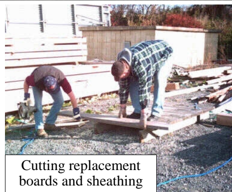
Cutting replacement boards and sheathing