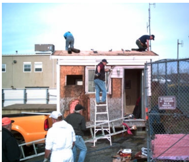
Removing roof shingles, window, rot ...

Here's what greeted the work party – Missing siding, dissolving sheathing, wet insulation and “I can't believe the roof doesn't leak!” shingles. What a sad sight!