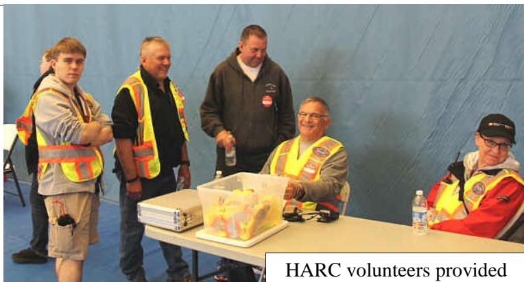
HARC volunteers provided communications and more for the MS Walk, 2017