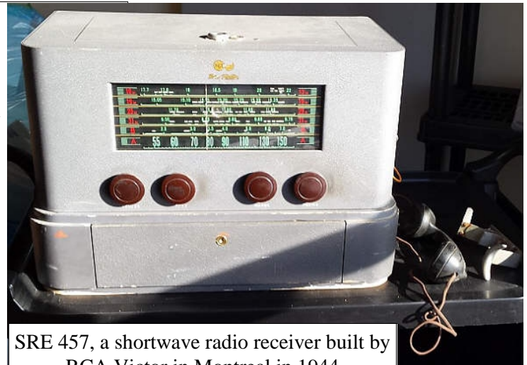
SRE 457, a shortwave radio receiver built by RCA Victor in Montreal in 1944

"Cleaning your house while your kids are still growing up is like shoveling the sidewalk before it stops snowing." -Phyllis Diller