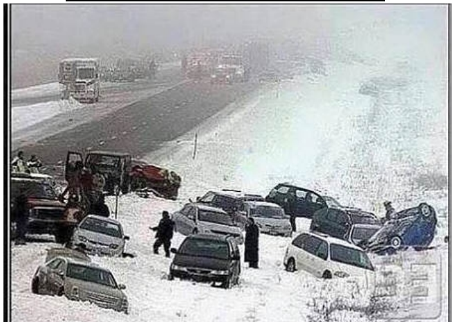
Annual Meeting of Canada's Summer Tire Club

Ham Radio for Maritimers by Maritimers www.maritimeamateur.ca