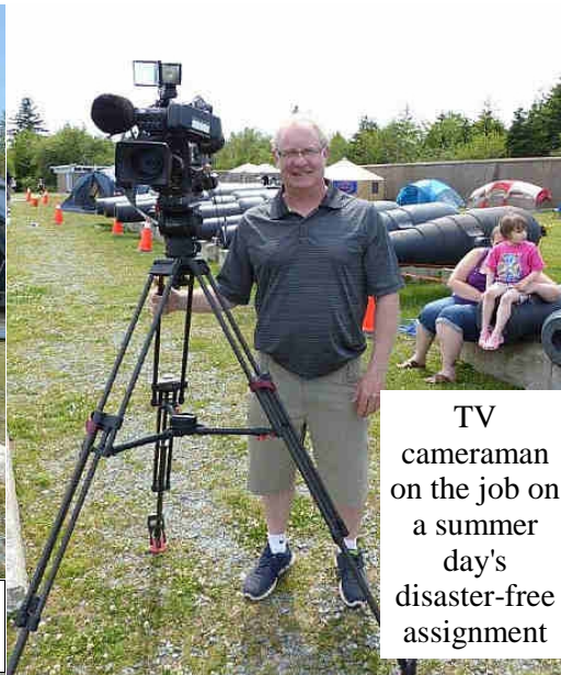
TV cameraman on the job on a summer day's disaster-free assignment