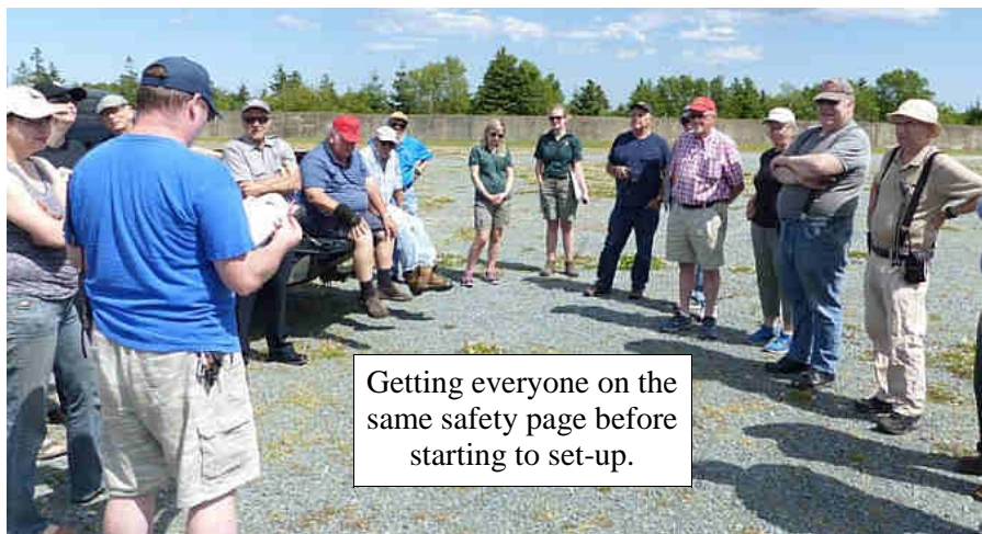
Getting everyone on the same safety page before starting to set-up.